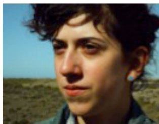
A Secret World