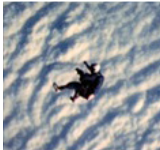
The End of Time