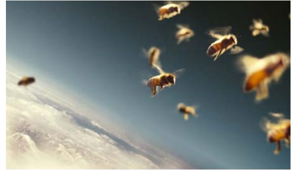
More Than Honey