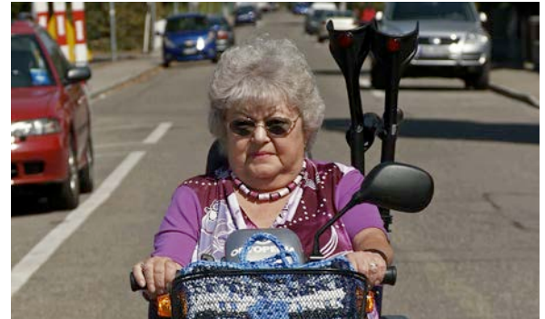
One Day to the Next