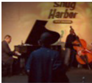
Return to Gorée