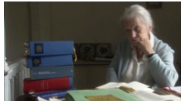
The Woman with the 5 Elephants