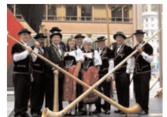
New Glarus Folklore Group