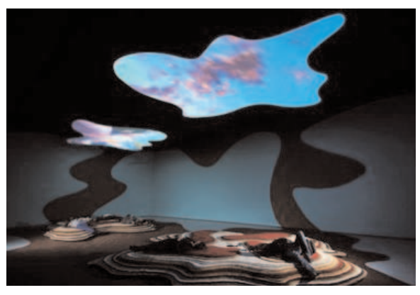
Tyngdkraft, var min vän (Gravity Be My Friend), 2007. Audio-Video Installation. Installation view, Magasin 3 Stockholm, Konsthall, Stockholm. Courtesy the artist, Hauser & Wirt and Luhring Augustine, New York.

Just outside the east entrance to the Wexner Center, Rist projects the nine video segments