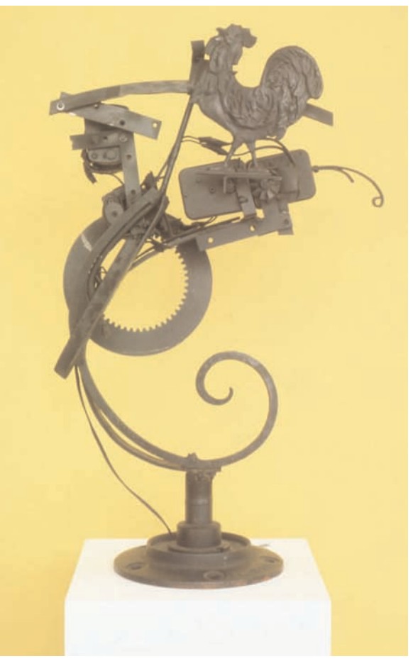
Jean Tinguely, Motor Cocktail, 1965. Collection Museum of Contemporary Art, Chicago. © 2011 Artists Rights Society (ARS), New York / ADAGP, Paris.

Tinguely's sculpture will take pride of place in the forthcoming exhibition that brings together artists in the MCA Collection who worked with sound