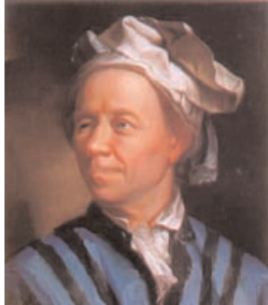
Leonhard Euler, 1707–1783