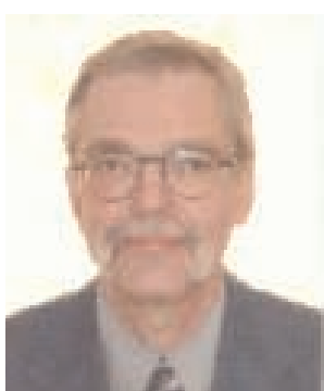
Consul General Giambattista Mondada