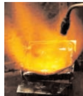
The Gold Weaver